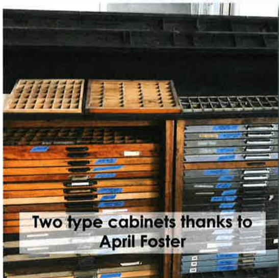
Two type cabinets thanks to April Foster