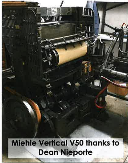
Miehle Vertical V50 thanks to Dean Nieporte

floor, and expanding our training capabilities in order to educate anyone who wants to learn about letterpress printing. Check out some of interesting things that are now in the museum.