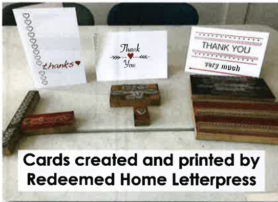
Cards created and printed by Redeemed Home Letterpress